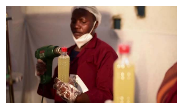
Packaging the juice and wine then sealing. The program was fully funded by the U.S Department of State